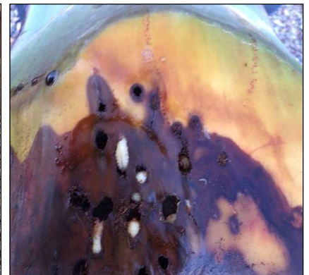
Snout-nosed beetle larvae maggots Agave

how they were all collapsing last June from lack of water? Ed.) .... The bite of the weevil deposits bacteria that literally rot the agave. As the tissues soften and decay, the parent and its progeny are merrily munching away on your plant. Damage occurs quickly, followed by death.”