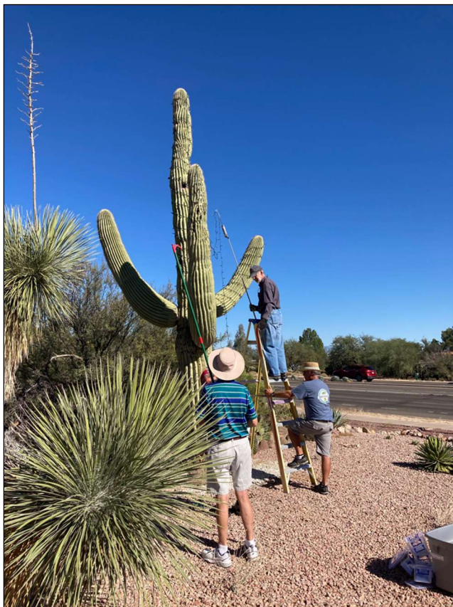
November 29 th Decorating our front.