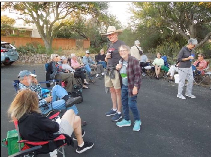
November 18 th Third Thirsty Thursday