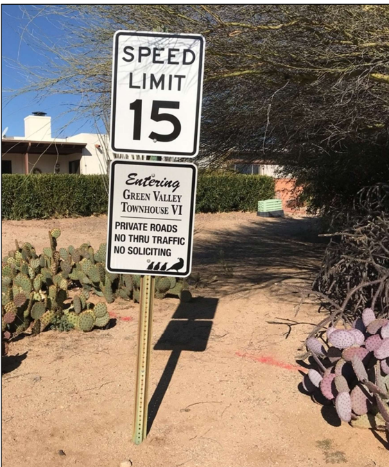
Our main entrance sign on Los Topacios