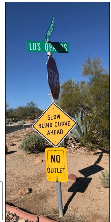
Sign on Los Topacios just below the curve by Placita Topa on Los Topacios

It is hoped that the 15mph signs and the "Slow Blind Curve Ahead" sign just below the curve on Los Topacios by Placita Topa will have the desired effect and prevent people racing up the street. If it doesn't, the next move may have to be speed bumps, as both Townhouse IV and Continental Vistas have installed.