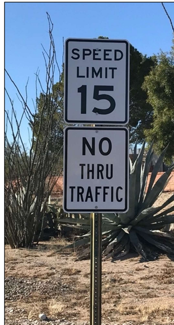
Sign at the Alegria end of Los Topacios