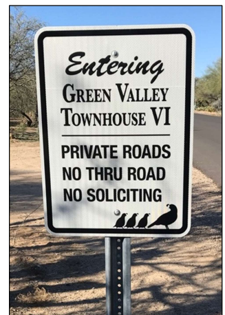
Sign on the left of Alegria just above the Church, opposite a similar sign for Townhouse IV on the right of Alegria