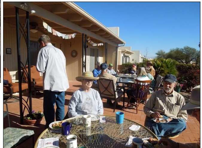
February 8 th After-landscaping coffee on the Battermans' patio