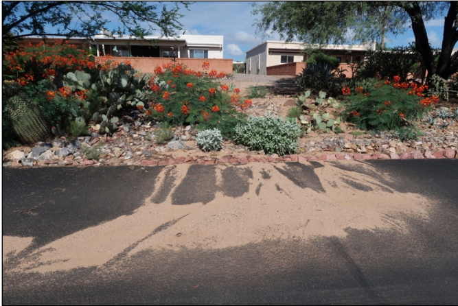
August sand on Los Zafiros

The good news is that the ditch work on our side of Alegria, undertaken in the spring by both our volunteers and Felix Landscaping, was generally very successful. There are plans for improving the Alegria ditch further before next monsoon season, with more help from THVI volunteers. Stay tuned for calls to assist!