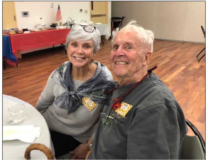
Veterans' Day Party