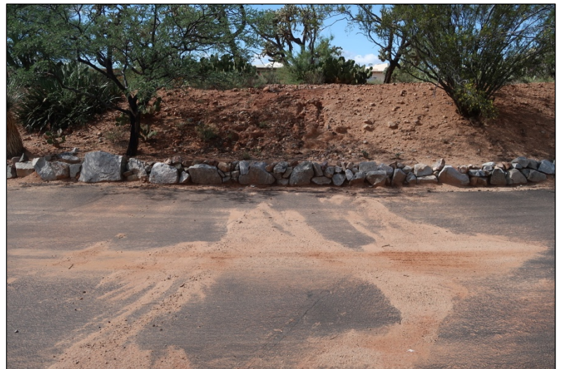
August bank erosion and sand on Los Opalos

The sand was especially problematic in areas where the banks or the flatter common area do not have much vegetation to slow down or prevent the flow of water, as in this steep piece of bank by the Los Opalos circle, see photo below.