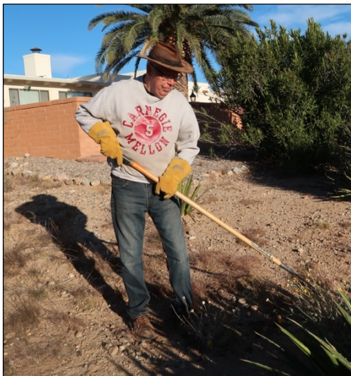
A few of the regular landscaping volunteers

Come meet some of your neighbors, get some exercise, learn about native plants and animals!